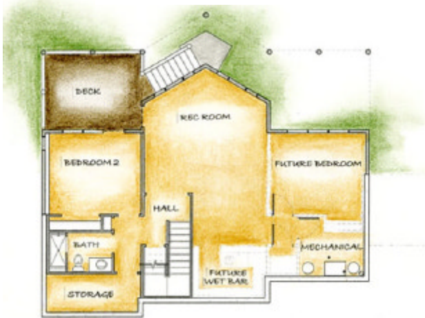
Lower Level Floor Plan